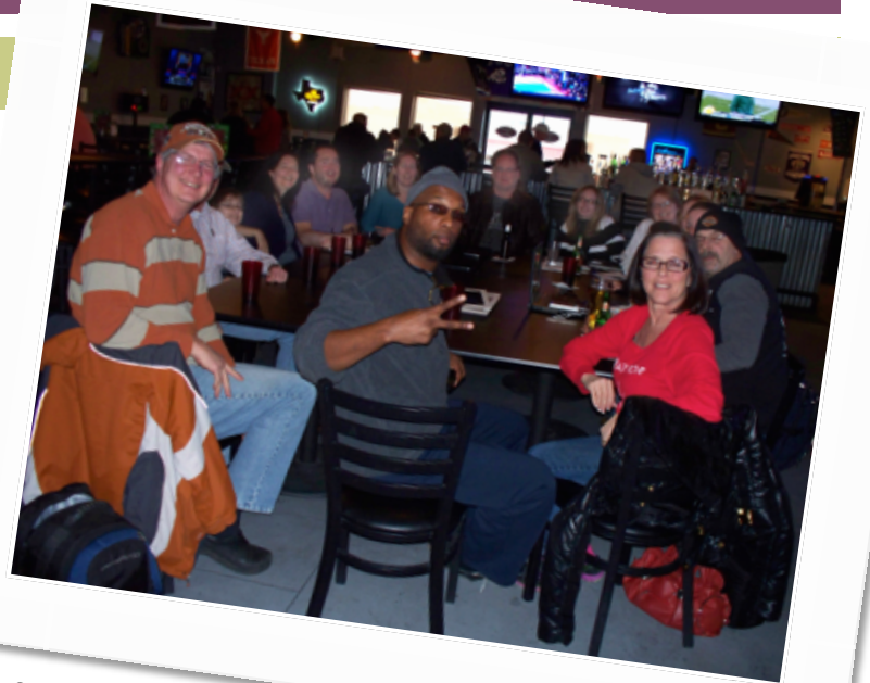
Second Meetup.

Our Meetup group can be found at: http://www.meetup.com/Rowlett-Texas-Photography-Club-Meetup/