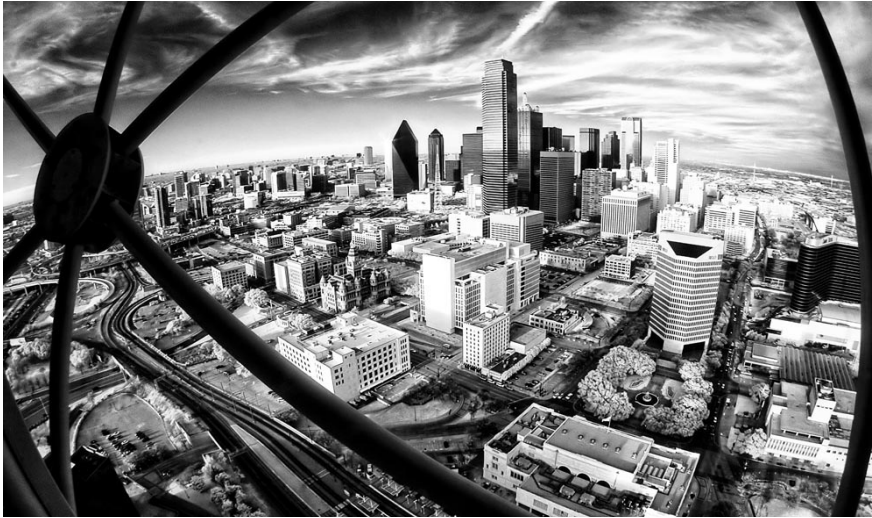
Dallas from Reunion Tower.